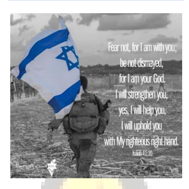
Name the Episode