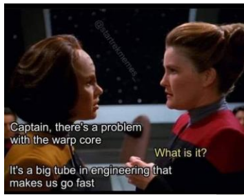
Captain, there's a problem with the warp core