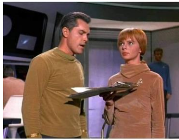
"Why are you handing me a clipboard? It's 2254. We're on a faster-than-light starship. C'mon, they had iPads 240 years ago."