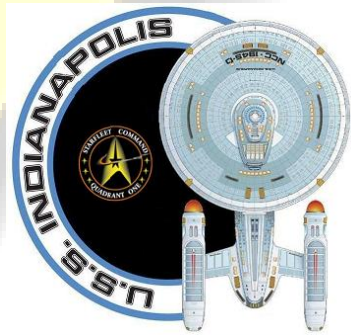
USS Indianapolis 11/25